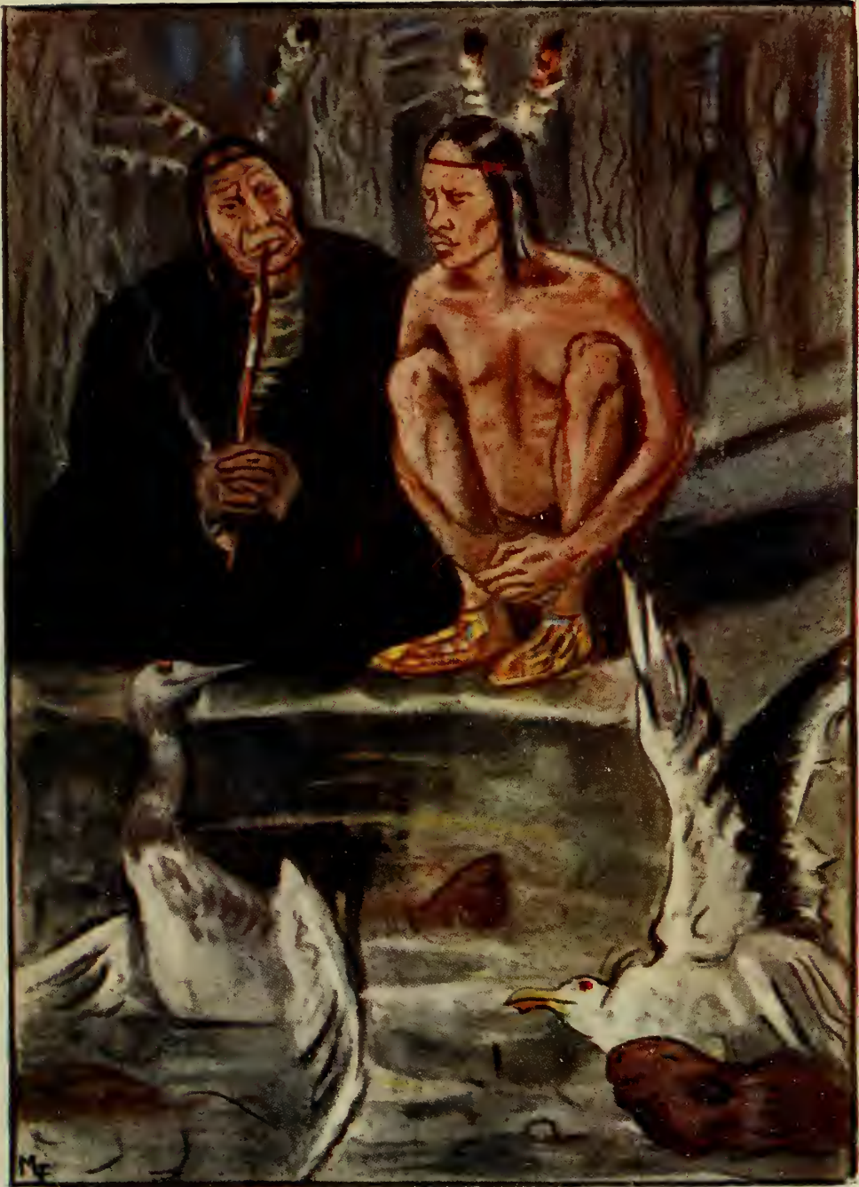
AND THEY SAT DOWN TOGETHER ON THE EDGE OF THE LAKE